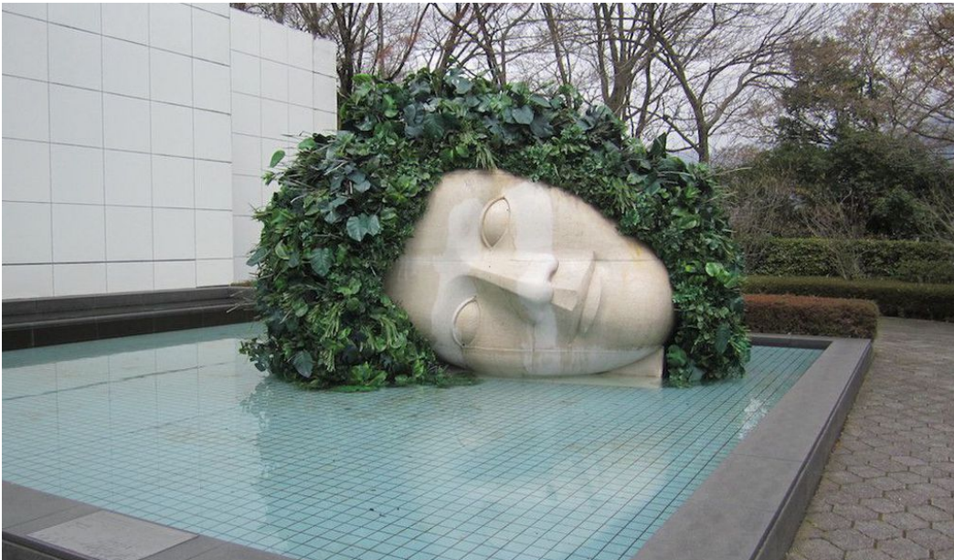
"La Pleureuse" by Francois-Xavier and Claude Lalanne (Amy Jane Gustafson - Flickr/Creative Commons)

When Hakone Open-Air Museum opened in 1969, it was Japan's first open-air museum. Now, a half-century later, it continues to be one of the country's most celebrated art institutions, amassing more than 1,000 sculptures in the years since. Located about 45 miles outside Yokohama in the town of Hakone, the property continues to be one of the region's biggest draws, not only for its collection, but also its sweeping views of the neighboring mountains and valleys. While the museum focuses largely on Japanese artists like Taro Okamoto and Yasuo Mizui , it also houses an elaborate collection of pieces by international names, such as 20th century English artist Henry Moore and post-Impressionist Italian sculptor Medardo Rosso . To help celebrate its 50th anniversary, Hakone will reopen its Picasso Hall, a 319-piece collection of the late Spanish artist's work.