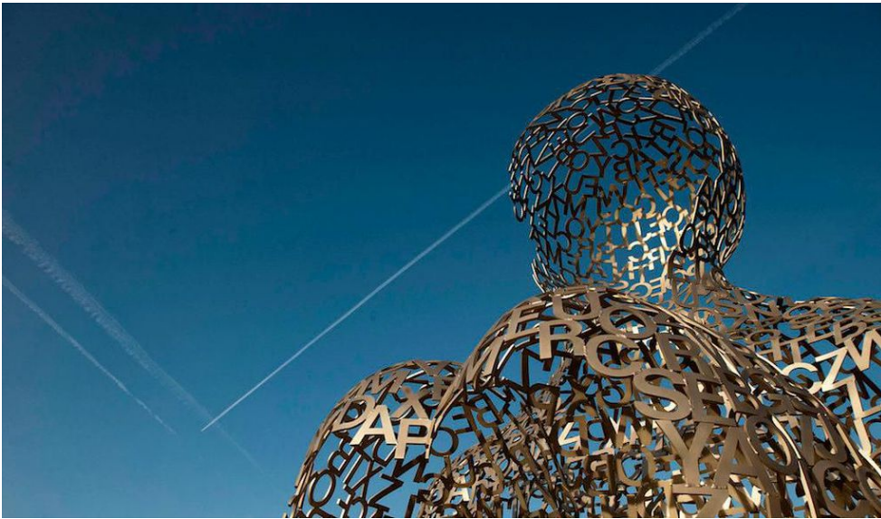
"House of Knowledge" by Jaume Plensa