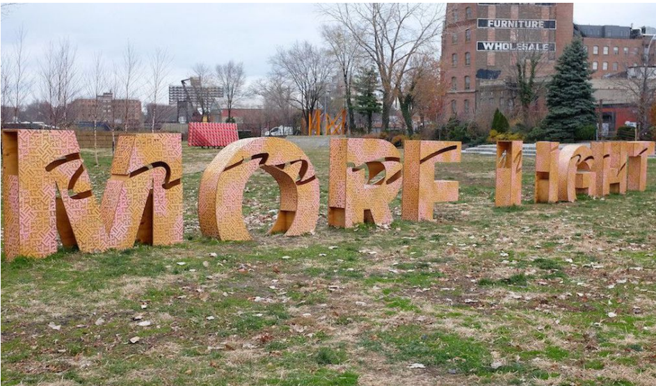
"More Light" by Galeria Perdida