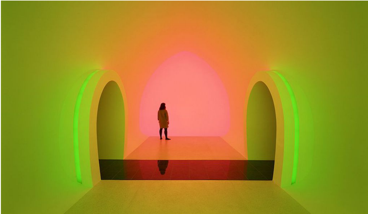
"Ganzfeld" by James Turrell

Only open since 2013, Ekebergparken has become a welcome addition to Oslo's growing art scene. Over the past six years the sculpture park has added several-dozen art installations to its 25-acre property, including works by performance artist Marina Abramović and a bronze sculpture of Venus de Milo by Salvador Dalí. Continuing to acquire pieces from high-profile artists, Ekebergparken will add not one but two highly anticipated installations this spring. The first is a duo of pieces, "Skyspace" and "Ganzfeld," light installations by American artist James Turrell from two of his most popular series, while Japanese artist Fujiko Nakaya will return for one day only (May 4) with her popular artificial fog installation that will transform the property's forest into a mystical wonderland.