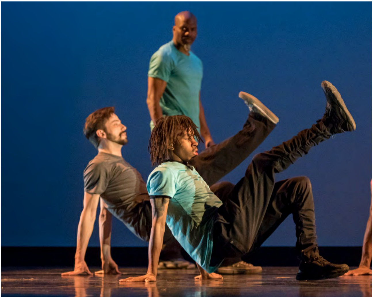
Raphael Xavier’s ‘Point of Interest’ runs Nov. 30 to Dec. 1.

“What we provide the community is different than other arts organizations here,” High says. “It adds to the mix of what’s available in the performing arts arena.”