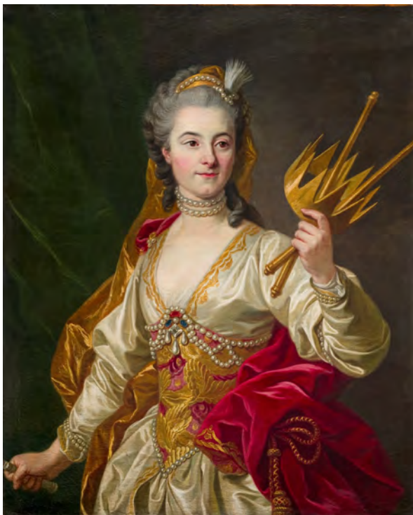
"Geneviève-Françoise-Laurette Randon da Malboissière as Melpomene" by Louis-Michel van Loo