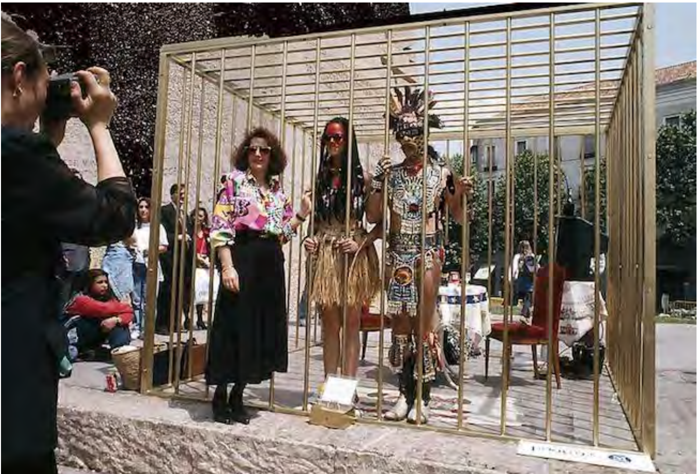
Coco Fusco and Guillermo Gómez-Peña. The Year of the White Bear and Two Undiscovered Amerindians Visit the West, 1992-1994. Performance.