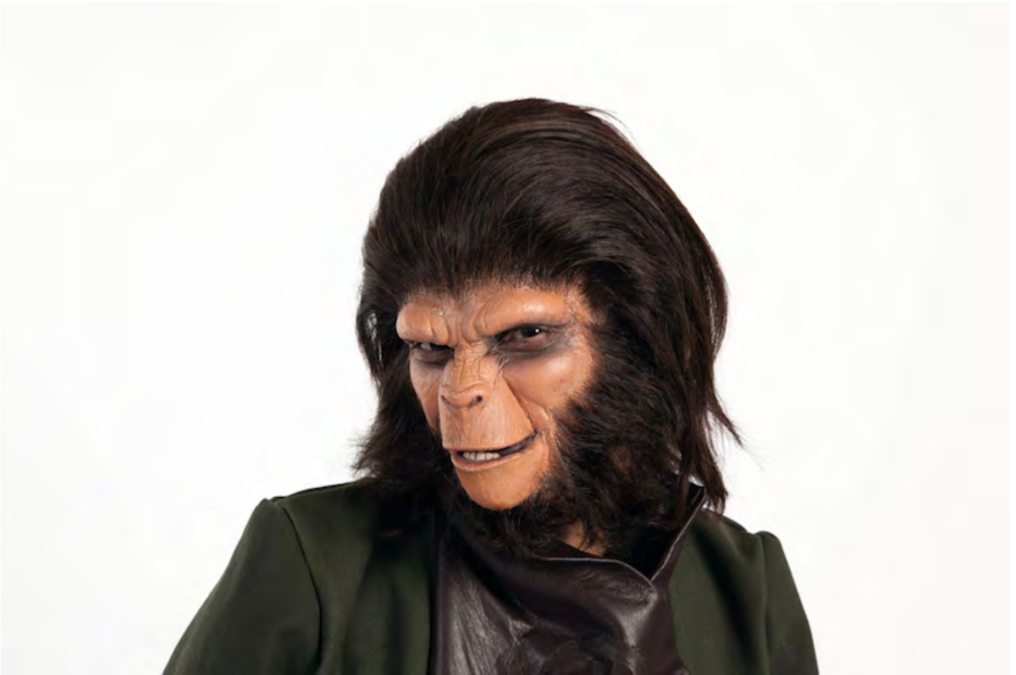
Coco Fusco. Observations of Predation in Humans: A Lecture by Dr. Zira, Animal Psychologist (study), 2013.

Midwest, living in seclusion for more than thirty years and observing human behavior on the Internet and television. After scientists concluded in 2012 that animals have consciousness, Zira decided to resurface and present her findings on humans. Here, Fusco discusses her revival of this unforgettable character.