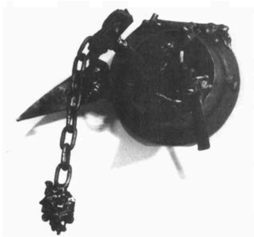
Echo Soweto 1980 Steel.