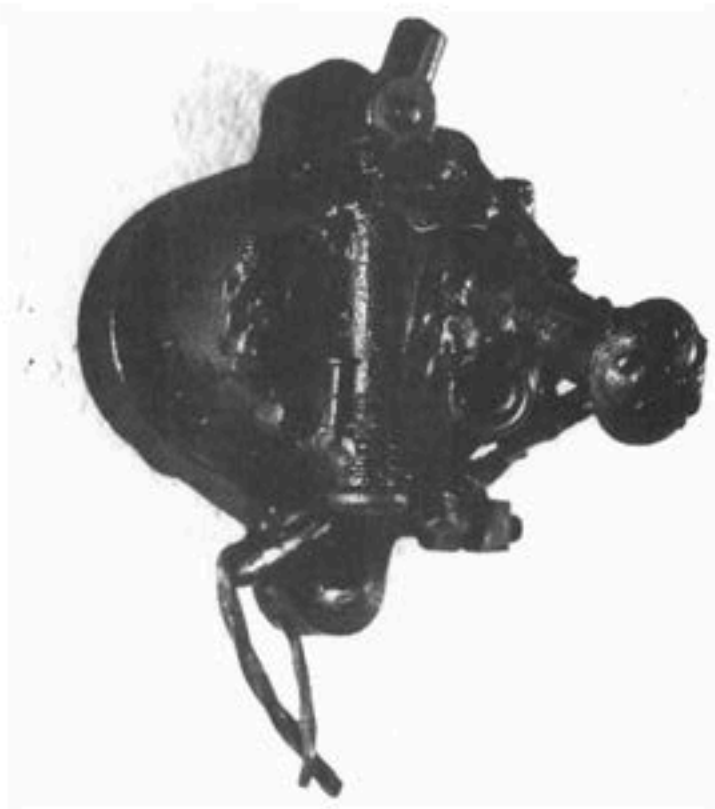
Igun Hammer 1981 Steel.