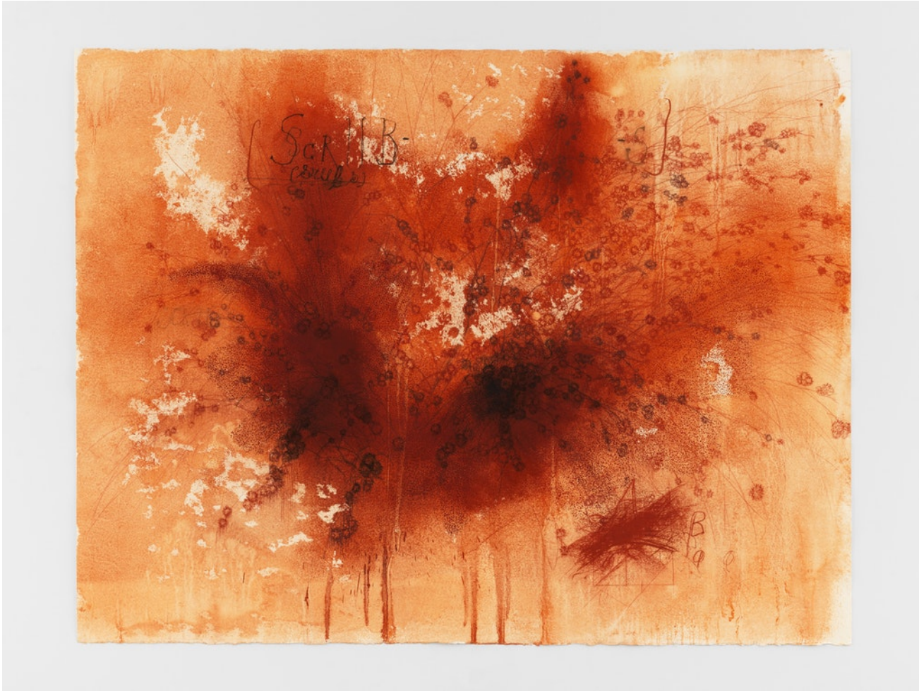
Ricardo Brey, Scrub , 2018. Mixed media on paper, 47 x 63 inches. Courtesy Alexander Gray Associates, New York. © Ricardo Brey/Artists Rights Society (ARS), New York.

Scrub (2018) is a work of orange pigment on paper; it is expressionist and messy in its use of color, with the word "Scrub" emblazoned on the upper-middle-left register of the composition. The word, in English usage, holds a double meaning: the idea of scrubbing something, rubbing a surface with pressure; and the notion of low-level vegetation. As with the title of the show, we are not entirely sure what the artist's intended meaning might be, but the experience of this work on paper is excellent. Densities of color occur mainly in the center of the work, with drips descending downward, toward the very bottom of the drawing. Its general disorganization might well align it with the esthetic of the New York School, although such a reading is distant from Brey's circumstances. Another drawing, employing the same orange hue, is called Fern at the Edge of the Road (2017). An amorphous mass of color, with a darkened center, fills the center of the work; Brey tends to work messily within the color schemes of his two-dimensional art. Perhaps this style functions as a bit of rebellion against the constraints of art that is cleanly made but spiritually lacking.